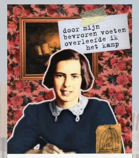
DUIK ONDER IN HET NIEUWE VERZETSMUSEUM Junior HE DUTCH RESISTANCE MUSEUM Junior