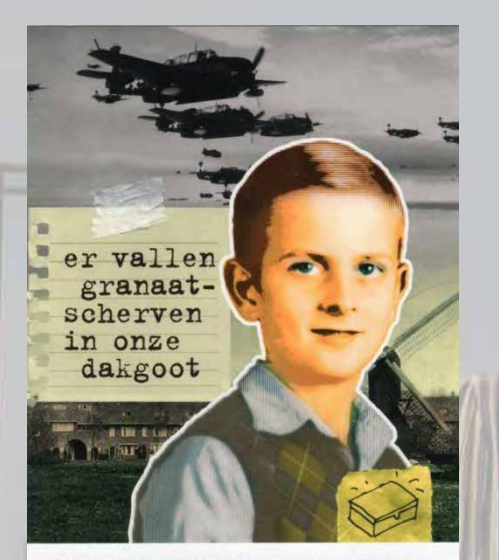
DUIK ONDER IN HET NIEUWE VERZETSMUSEUM Junior THE DUTCH RESISTANCE MUSEUM Junior