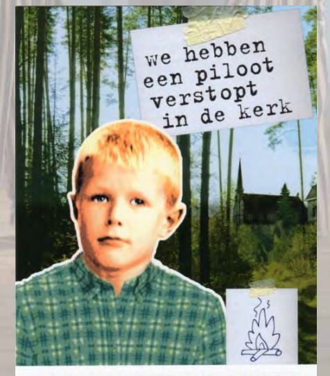
DUIK ONDER IN HET NIEUWE VERZETS MUSEUM Junior HE DUIT RESISTANCE MUSEUM Junior