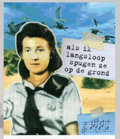
DUIK ONDER IN HET NIEUWE VERZETS MUSEUM Junior THE DUTCH RESISTANCE MUSEUM Junior