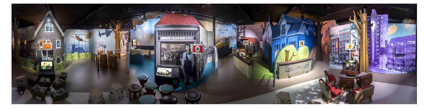
(Resistance Museum Amsterdam, Junior Museum)

(PP p.6) At these times, war and memorial museums are facing a turning point and will have to familiarise themselves with new approaches. The generation that lived through the war passes away. That means that the memories of WW2 will be transferred in another, more indirect way. The bond with the public is no longer as self-evident as it was. New target groups do not have a 'direct' relationship with memories of the war. For them, the history of the period between 1940 and 1945 is truly the past.