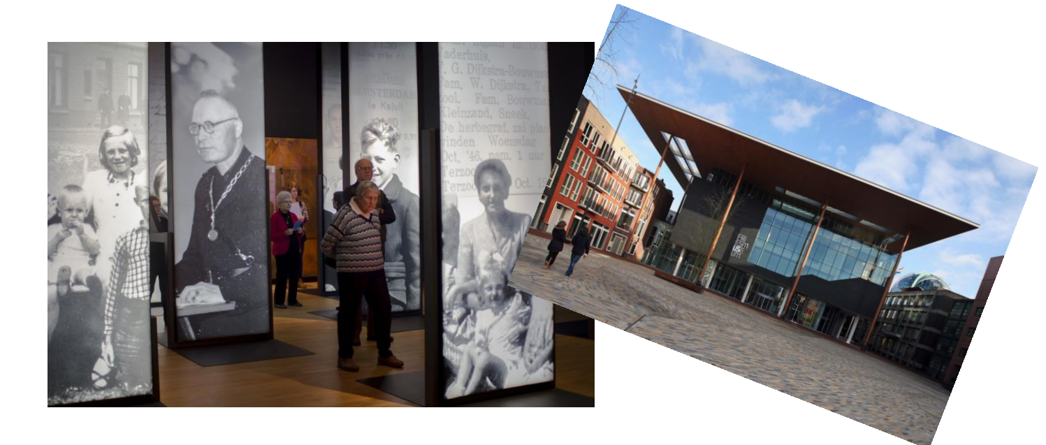
(PP p. 16-19) The Dutch Resistance Museum, Amsterdam www.verzetsmuseum.org

(PP p. 15) The Resistance Museum in Friesland, Leeuwarden (the war museums for the northern provinces in the Netherlands) <u>http://www.friesverzetsmuseum.nl/</u>